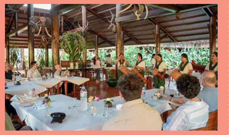
AN UPLIFTING WORKSHOP AND LIVELY PERFORMANCE

All-female troupe Medha presents the aspirations, experiences, and relationships of young Cambodian women through traditional art forms - dance, drums, and chanting - original compositions and choreographies, and contemporary storytelling. These multi-talented performers will take you on an engaging and inspiring journey; you won't be able to stop yourself from clapping along with them!